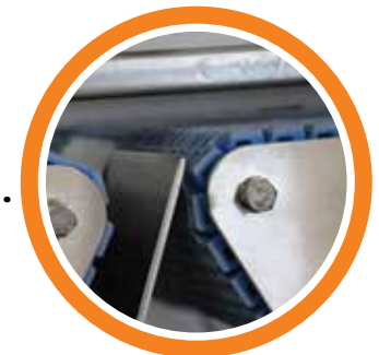
Ultra high quality conveyor belts