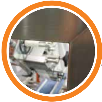
Fully welded stainless steel frame