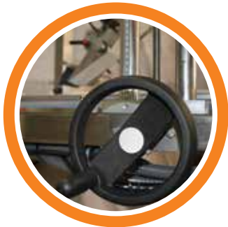
Tool-less and efficient adjustment handles