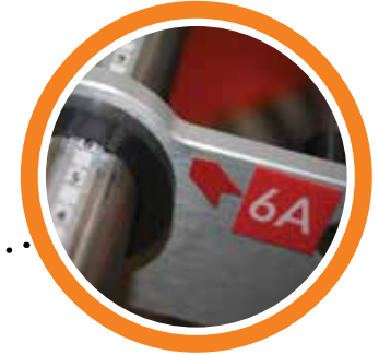
Quick-change color coded changeover stations