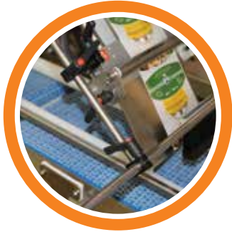
100% speed synchronized wipe-on application